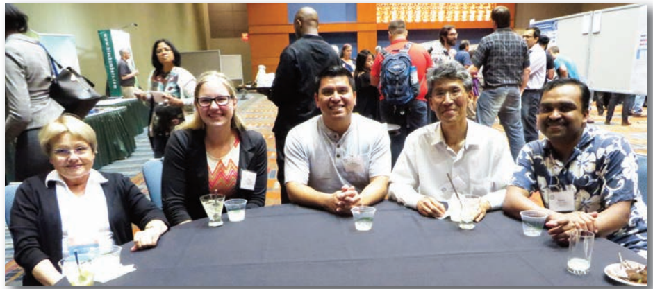
While science is key, fellowship and camaraderie are also important aspects of the SIVB.

The In Vitro Report publishes online issues quarterly and includes information pertinent to and from our members. We encourage everyone to take an active role in this publication, especially in the SciNews and Explants sections of each issue, by sharing their personal news. Use this opportunity to provide updates on your life