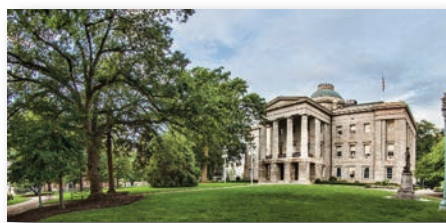
Raleigh was the site of the 2017 In Vitro Biology Meeting.

It seems like only yesterday that I began my term as President of SIVB—and suddenly I find this is my last opportunity to write a short message for the 2017 annual report. SIVB is a vital part of an ‘evidence based’ network of science professionals that contributes to the body of scientific research and to the greater good of society. Recently I took advantage of an invitation to speak for about 10 minutes to a church group of ~150 individuals about the reality of climate change, how crop plants were positive in using CO 2 rather than adding carbon and contributing to global warming. I was asked because of my science background and there was a motion before the body about supporting ‘sustainable energy’ sources compared to carbon based energy sources. I used every second of my allotted time, and I’m pleased to say that the motion garnered over 70% of the votes cast. I like to think that my 40+ years membership in SIVB was great preparation for this speaking challenge.