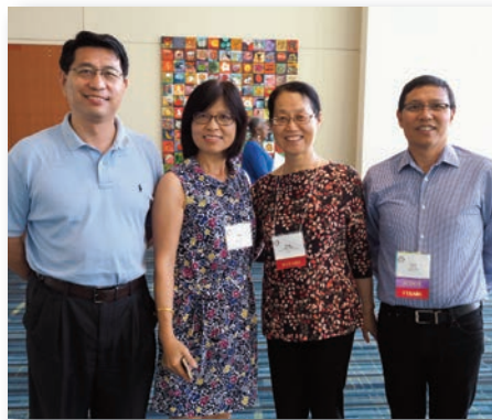
SIVB welcomes both members and prospective members to join us at our annual meeting.