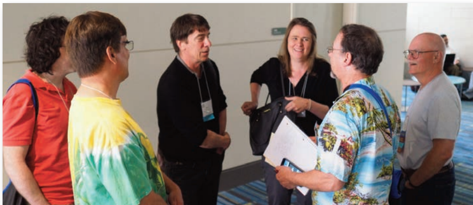
Impromptu gatherings at the SIVB meetings, such as the one pictured above, allow for the exchange of scientific ideas addressing serious issues facing our members.