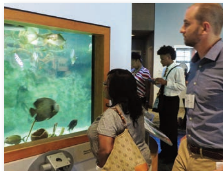
SIVB members explore science exhibits at the North Carolina Museum of Science.

At the 2017 In Vitro Biology Meeting, the final number of registrants reached 398. There were 131 members, 20 group registrants, 11 non-members, 17 research technicians, 17 post docs, 89 student, 5 one-day, 12 two-day, 2 emeritus, 4 guests, 11 volunteer and 59 speaker registrants. There were also 2 staff registrants and 18 exhibitors. Positive circumstances that can be cited in having contributed to 2017 attendance numbers include SIVB’s solid presence in North Carolina due to the significant biotech community in which SIVB was able to reach, active solicitation of speakers from local universities by the Program Committee, our Local Organizing Committee’s reaching out to local scientists that may have not heard of us, accessibility to Group Registration Rates, and working with the NC Biotechnology Center who included us on their calendar of events.