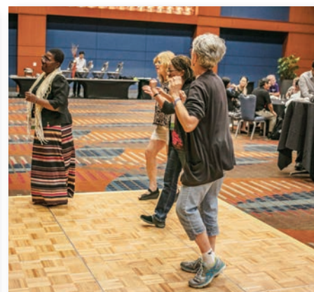
During the Joint Section's Social, Hobbit Nirvana entertained our members who took to the dance floor when they weren't enjoying the evening's refreshments.