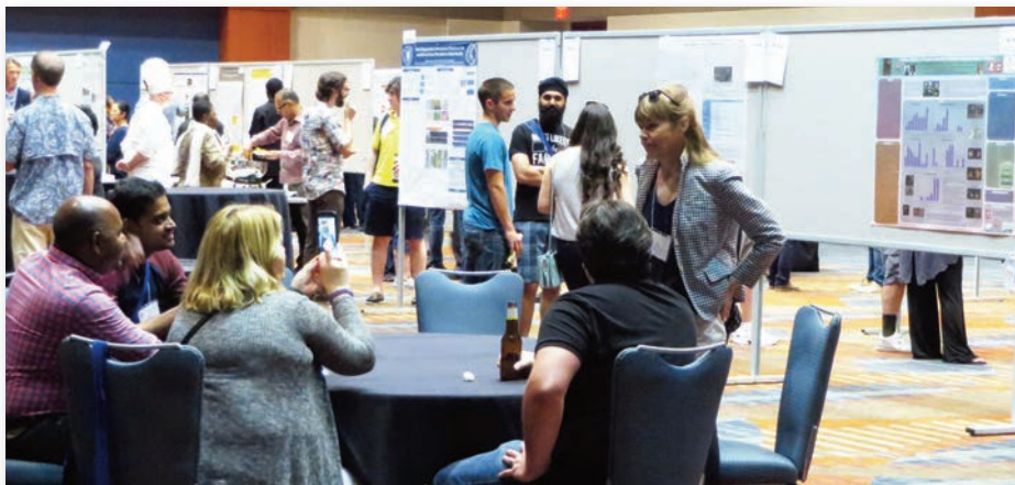
At the welcome reception of the 2017 Meeting, attendees used the opportunity to learn about new research while catching up with colleagues.

Saturday, we are offering a special follow up workshop to last year's successful Saturday Flow Cytometry workshop entitled "Go with the Flow: Flow Cytometry for Genome Sizing, Editing, and RNA Targeting." This year's session will focus on various topics for targeting and gene editing with plant specific applications and requires separate advance registration to participate.